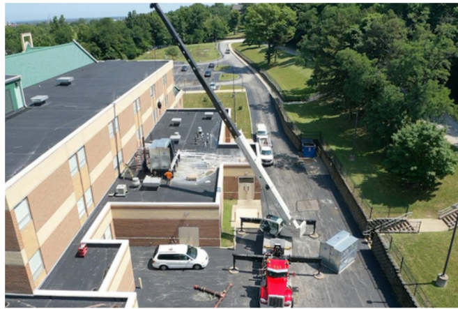
Above: Cranes move new chiller units into place on the roof of Kirk M.S.