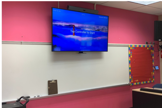
Below: 75" flat panel monitors with Neat Bar Pros are installed into every classroom at Shaw, Kirk, Mayfair, and Superior

Also at Kirk, the concrete on both sets of front stairs leading to the building from Terrace Road have been repaired. Finally, all student lockers at Kirk and Shaw received a new coat of paint, brightening the hallways.